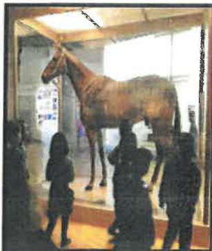
Grade 2 Excursion to the Museum

Watch this space for further information.